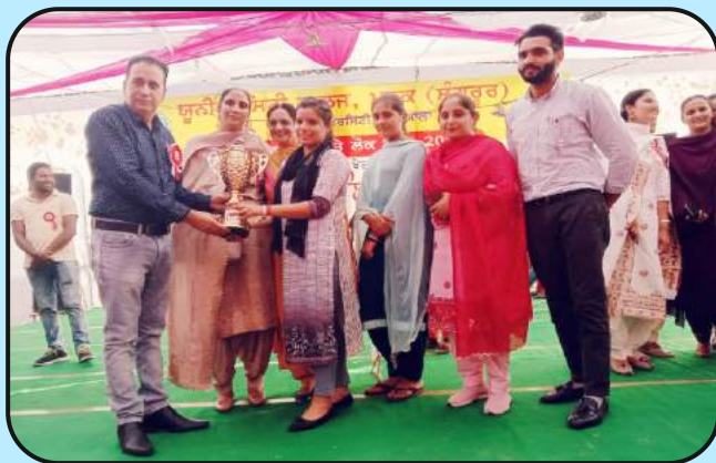
Zonal Festival Winner-Debate