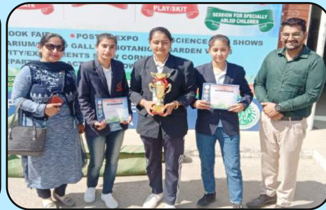
Punjabi Uni. Patiala Winner- Play