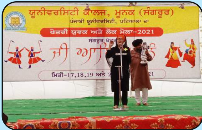
Zonal Festival Winner-Folk Song