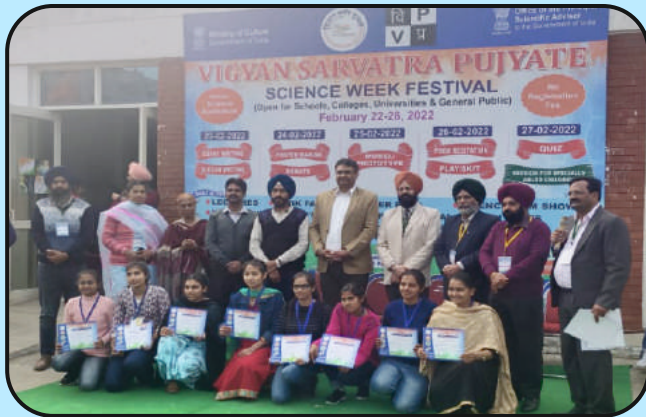
Punjabi Uni. Patiala Winner- Play