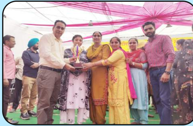
Zonal Festival Winner-Pehrawa