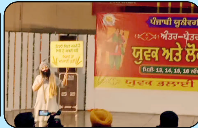
Inter Zonal at Pbi. Uni. Patiala