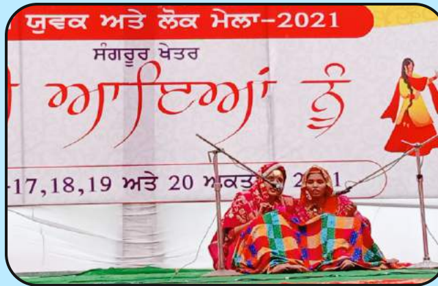
Zonal Festival Winner-Rivati Lok Geet