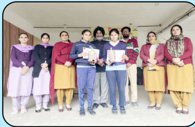
Distt. Winner NCSC-2021